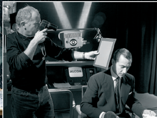
Inset: (L to R) DP Robert Elswit, ASC and actor David Strathairn preparing to shoot a scene from Good Night, and Good Luck .