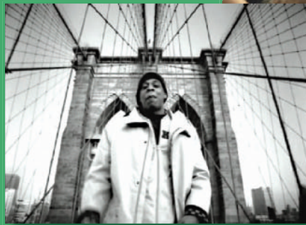
JAY-Z: PHOTO COURTESY OF ANONYMOUS CONTINENTAL-HELA RECORDS

Baca-Asay shot the entire video with a handheld camera and an 18mm lens in Brooklyn where Jay-Z grew up.