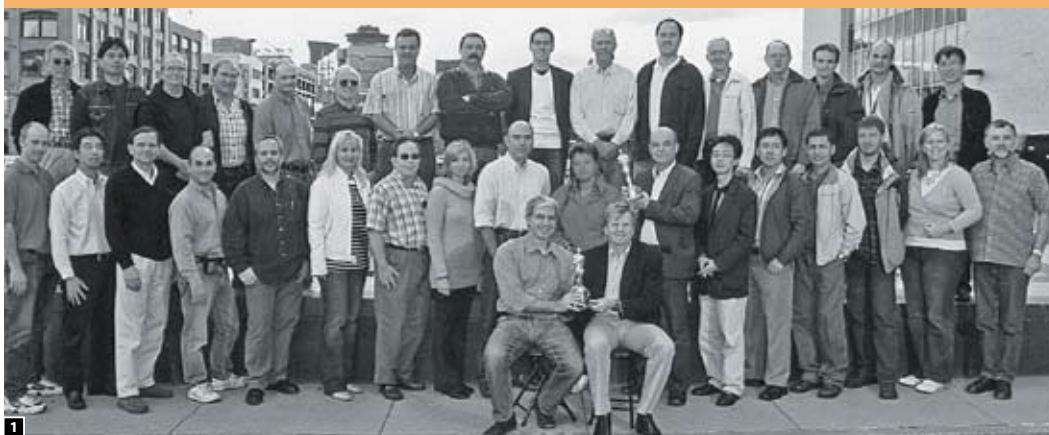
1 Delegates from the 2006 conference.

Eastman Kodak Company will share the Los Angeles experience with its Imagecare Program members by holding its second worldwide KODAK IMAGECARE Program Laboratories Conference in Hollywood, California. Designed exclusively for participating laboratories around the world, and organized by the company's